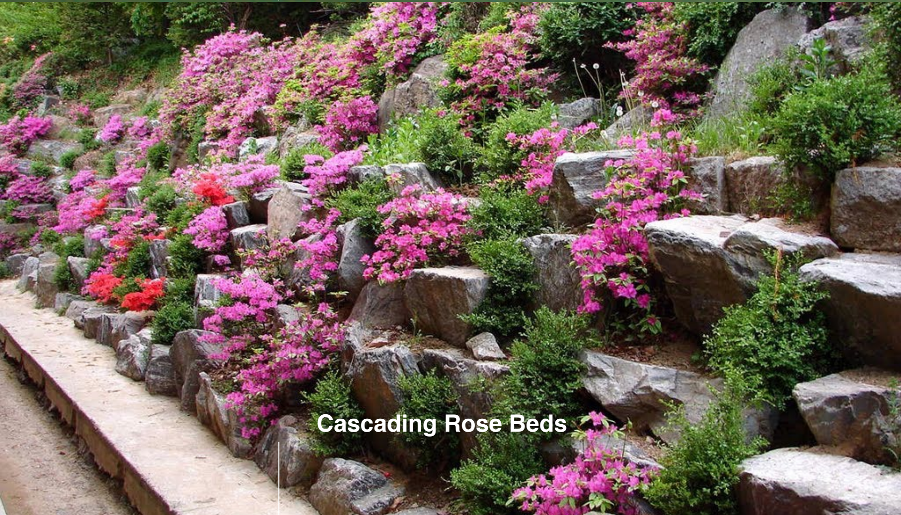
Cascading Rose Beds