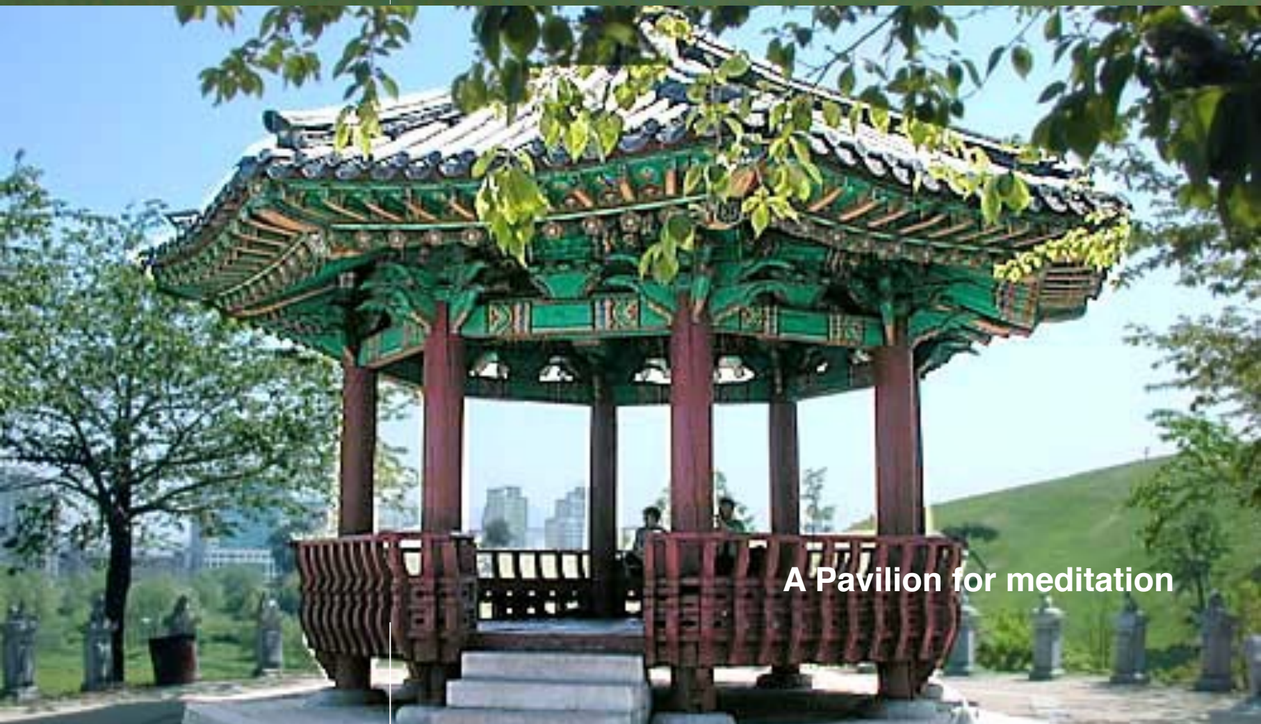
A Pavilion for meditation